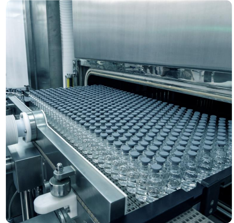
Automatic loading and unloading system - Lyophilizer

Quality Control laboratory for API & FDF batch release and stability testing.