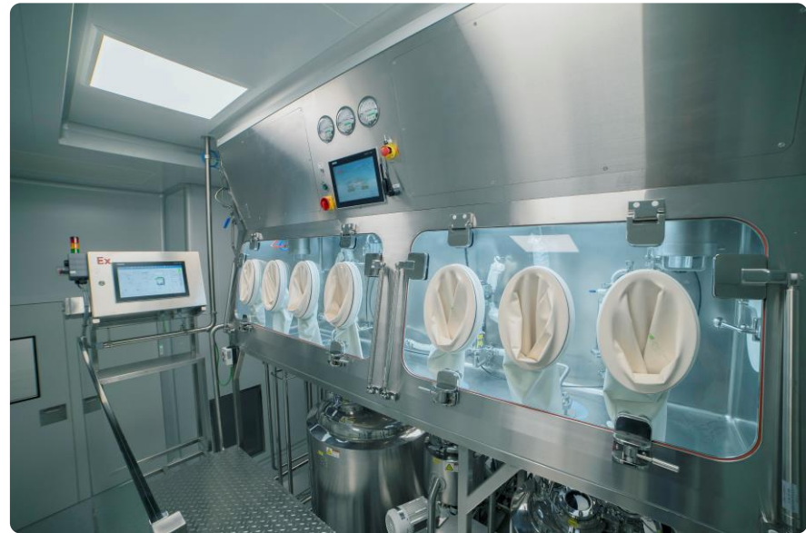
Isolator - Solution preparation system

Dosage form: Liquid or lyophilized vials